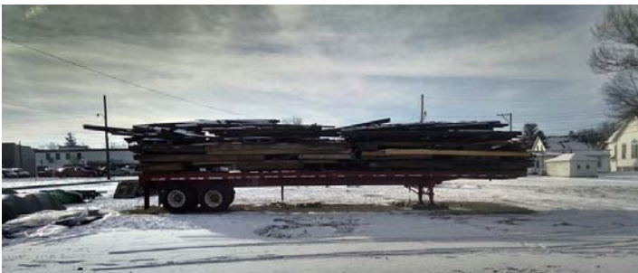
De-Constructed Depot before restoration begins

Currently, the project has a total of five phases and will take more money and time before the Depot is complete. Stop by the site anytime and see the progress that has been made so far!