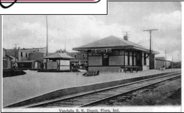
Vandalia R. R. Depot, Flora, Ind.

In its heyday, the Flora Railroad Depot served eight passenger trains a day. The last passenger train rolled through in 1958, fifty years after the depot was built.