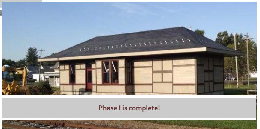
Phase I is complete!

If you would like to help with the Flora Depot Project please visit; http://www.floraindianadepot.org/give-to-the-flora-depot-project.html to donate or to contact Flora Main Street for more information!